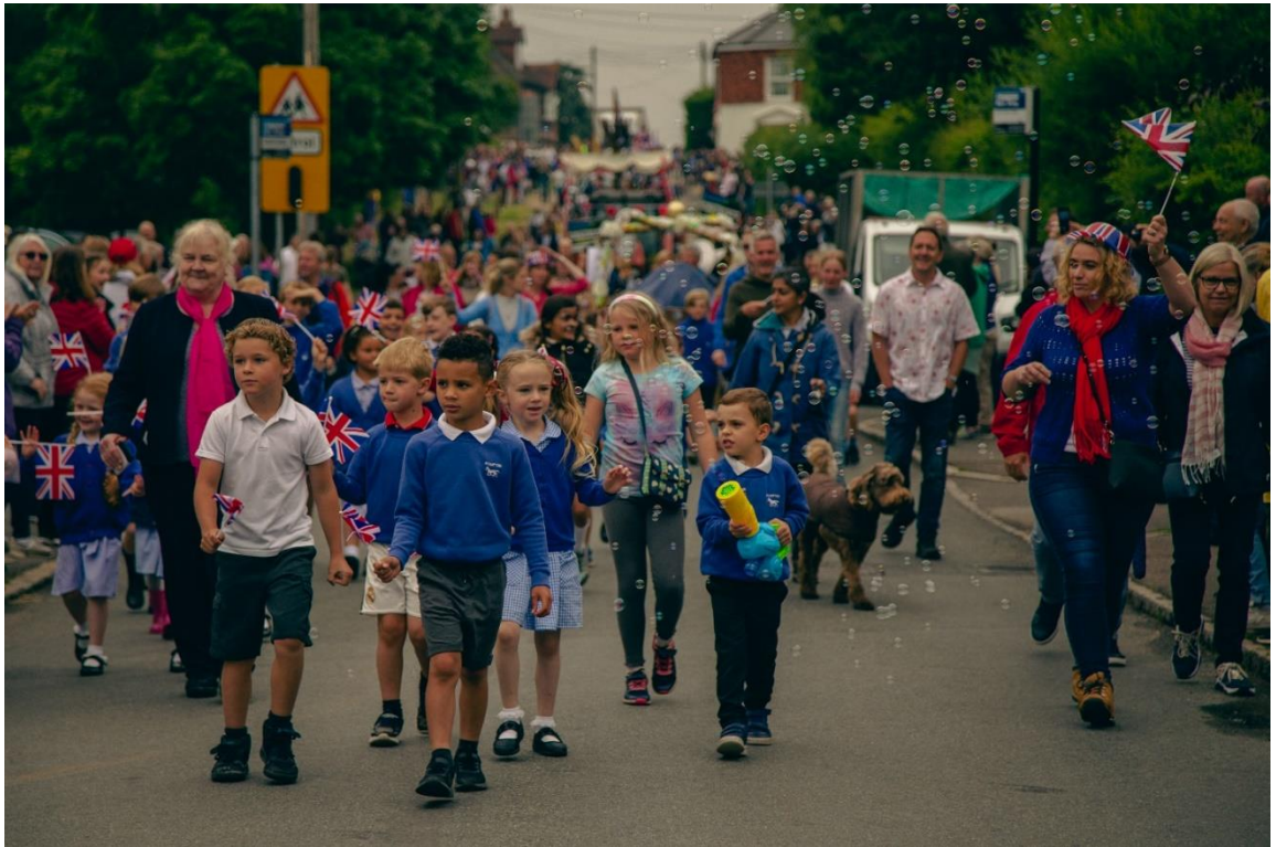
A few favourite photos from the pageant