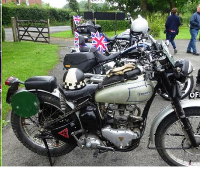
The car and motorcycle pageant entries met up at The Plough, before following the floats and walkers.